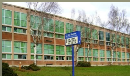
Aki Kurose Middle School Academy

“To educate, empower, and mobilize Southeast Seattle to ensure our kids are safe, happy, and healthy so they can learn. To reduce and prevent youth substance abuse and violence in Southeast Seattle using culturally appropriate strategies.”