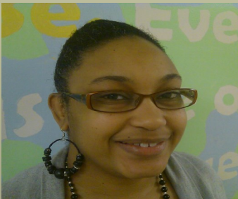
Aki Kurose Middle School Prevention/Intervention Specialist